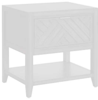
Lenox Leg Nightstand with USB-C Port S964-055