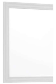
Lenox Dresser Mirror S964-030

See an error on this page? Please report it so that we may correct it.