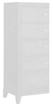
Lenox 5-Drawer Chest S964-040