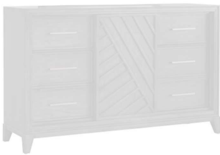
Lenox 6-Drawer Sliding Door Dresser with Storage S964-010