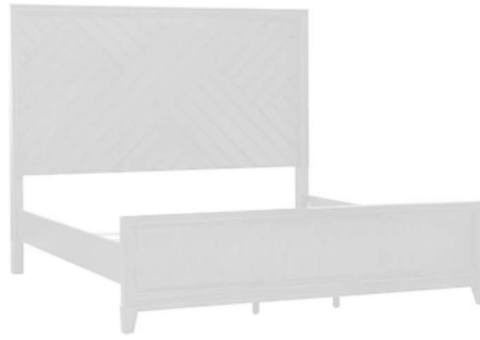
Lenox King Panel Bed S964-BR-K3