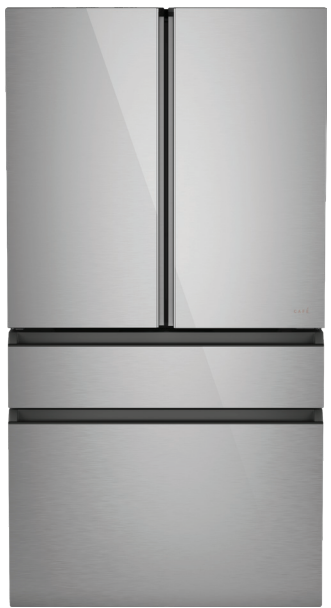
CJE23DM5WS5 Platinum Glass with Integrated Pockets