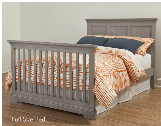
Full Size Bed