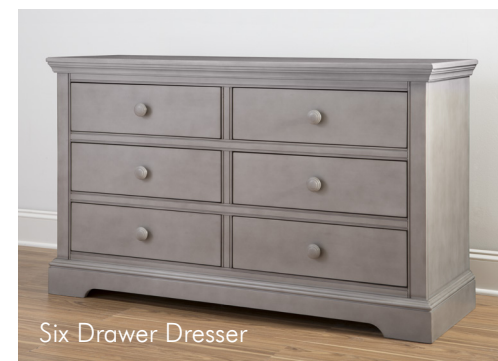
Six Drawer Dresser