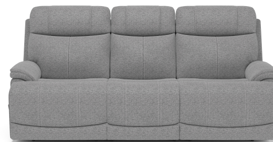
1584-62PH in Fabric 753-01