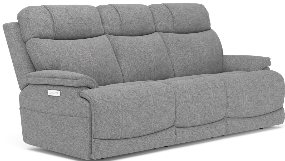
1584-62PH in Fabric 753-01