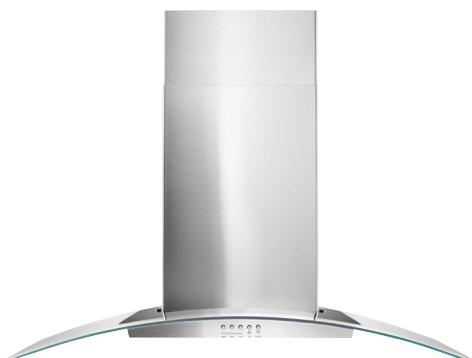
Stainless Steel WVW51UC6FS