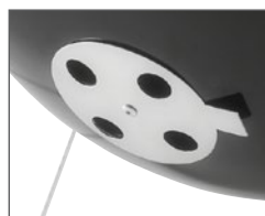
Temperature Control Vent