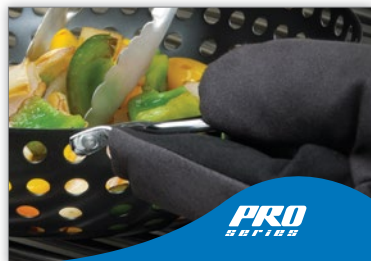
Heat Resistant Gloves 62140