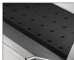
Charcoal Access Door