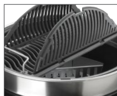
Hinged Cooking Grids Three Height Adjustments