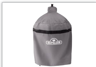
Kettle Leg Grill Cover 63910