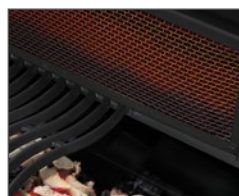
Rear Charcoal Rotisserie Burner