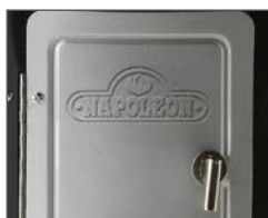
Easy Access Doors