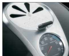
ACCU-PROBE ™ Temperature Gauge