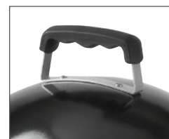
Sturdy Lid Handle