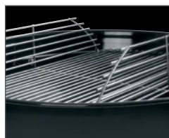
Hinged Cooking Grids