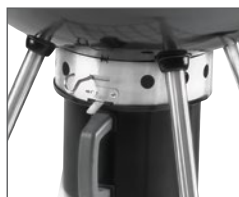
Removable Heavy Steel Ash Catcher