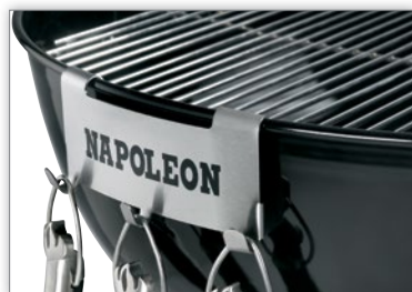
Charcoal Kettle Tool Hanger 55100