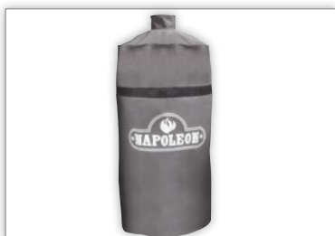
AS300K Apollo® Grill Cover 63900