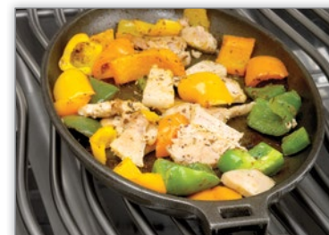
Professional Cast Iron Skillet 56003