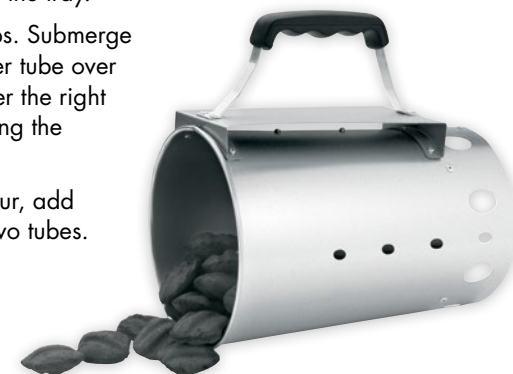
Exclusive Charcoal Tray 67731

Smoke the meat for several hours under a closed lid. To achieve maximum flavour, add fresh, pre-soaked wood chips several times during the cooking process or use two tubes.