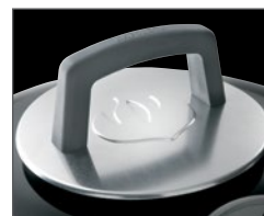
Cool Touch Handle