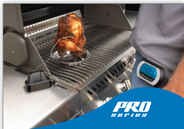
Wireless Digital Thermometer 70006