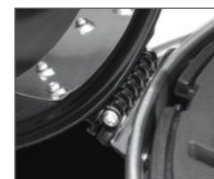
Ergonomic Hinged Lid