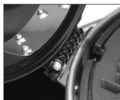
Ergonomic Hinged Lid