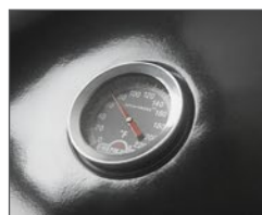
ACCU-PROBE™ Temperature Gauge

Temperature eyelets at each grill level provide access for inserting a thermometer probe