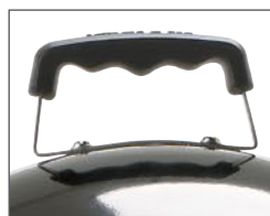
Sturdy Lid Handle