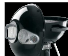
Built-In Lid Hanger