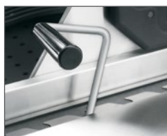
Adjustable Charcoal Bed