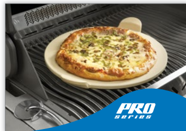
Professional Pizza Set 70001