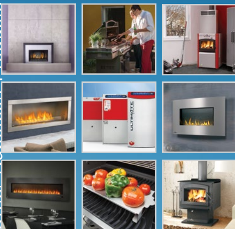
Fireplace Inserts • Gas Grills • Hybrid Furnaces • Outdoor Fireplaces Gas Furnaces • Gas Fireplaces • Electric Fireplaces • Accessories • Wood Stoves