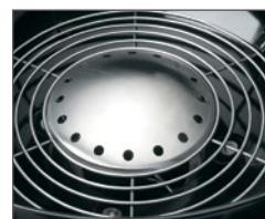
Stainless Steel Heat Diffuser