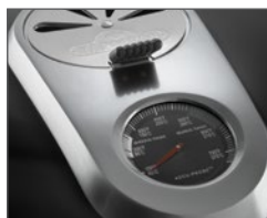
ACCU-PROBE™ Temperature Gauge