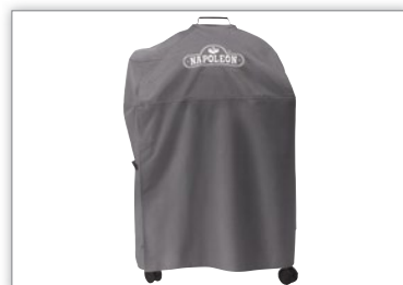
Kettle Cart Cover 63911