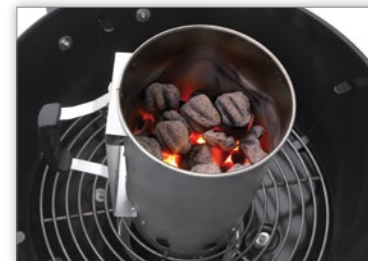
Charcoal Starter 67800