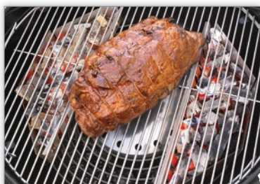
Charcoal Baskets 67400