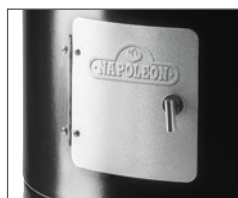
Easy Access Doors