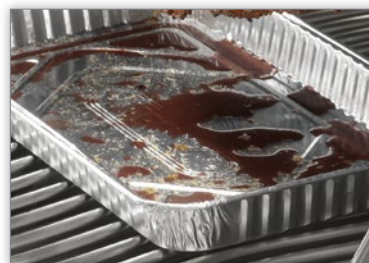
Large Drip Trays 62008