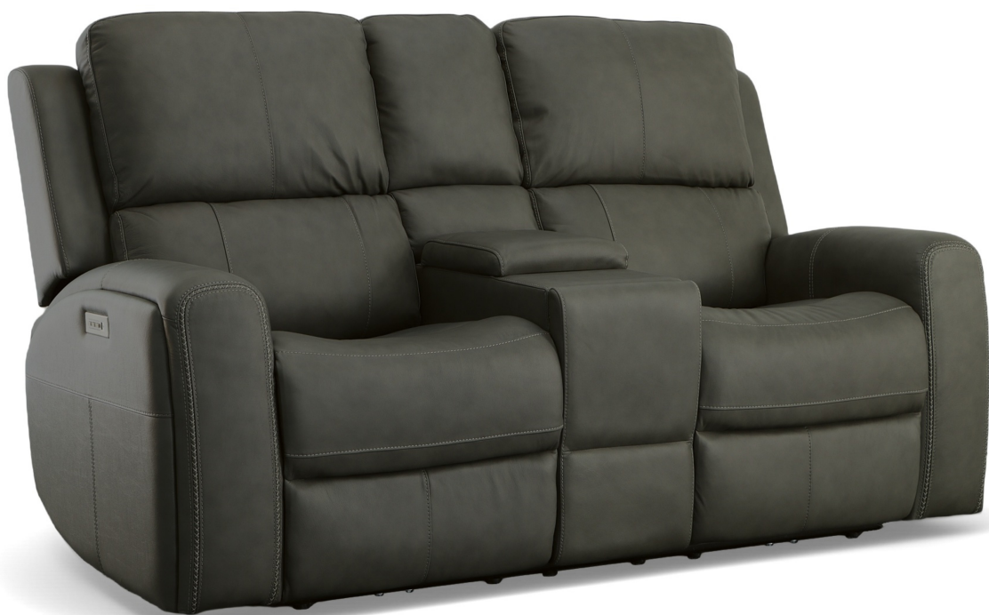
1043-64PH in Leather 946-02