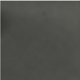
Charcoal 946-02 Leather/Match