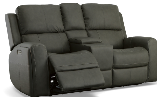
1043-64PH in Leather 946-02