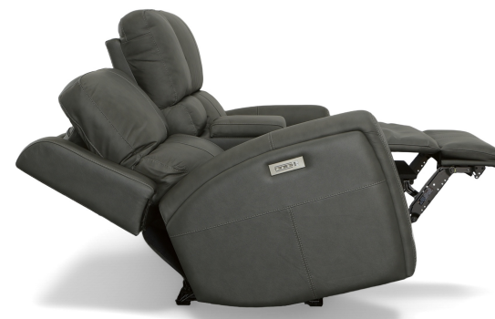
1043-64PH in Leather 946-02