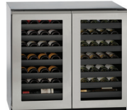
INTEGRATED FRAME (STAINLESS HANDLELESS PANEL)*