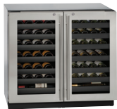
STAINLESS FRAME (LOCK)