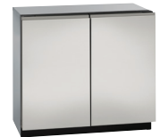
INTEGRATED SOLID (STAINLESS HANDLELESS PANEL)*