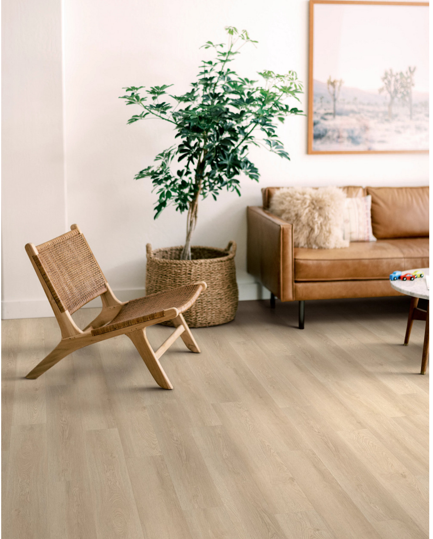
7194 Barley Field