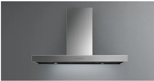
Photograph is for information purposes only. May not correspond to the selected version