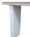
-976 Veneered Maple (Must specify finish)