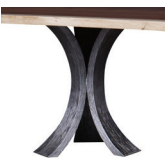
*-973 Textured Metal (Pewter)