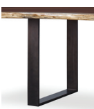
-971 Oiled Bronze Strap