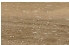
EW102 Blonde Cerused