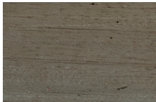
EW105 Slate Gray