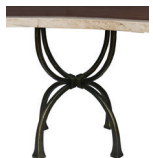
-974 Modeled Bronze