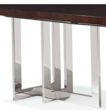
-972 Polished Nickel