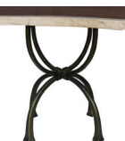
*-974 Modeled Bronze