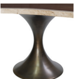
-977 Bronze Hourglass