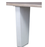
-976 Veneered Maple (Must specify finish)