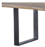
-970 Cast Iron Strap

(*Only available with 60” & 72” size Slab Tops)