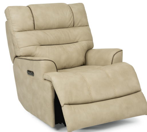
1718-50PH in fabric 112-72