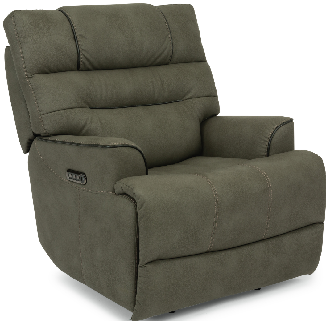
1718-50PH in fabric 112-02