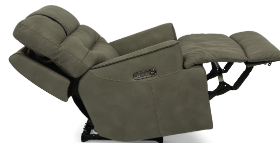
1718-50PH in fabric 112-02