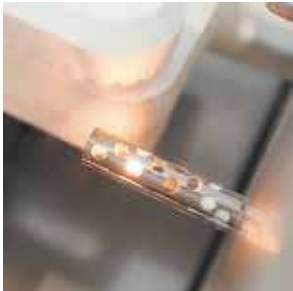
HOT SURFACE IGNITION