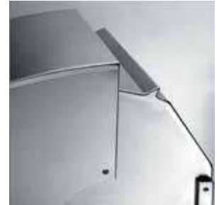
HEAT STABILIZING DESIGN