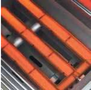
TRIDENT™ INFRARED BURNER

Our unrelenting attention to detail and our passion for innovation have fostered the stunning features that define the Lynx Professional Series. These features begin with meticulous hand-crafted excellence, and they culminate in powerful capabilities that give you precision control.