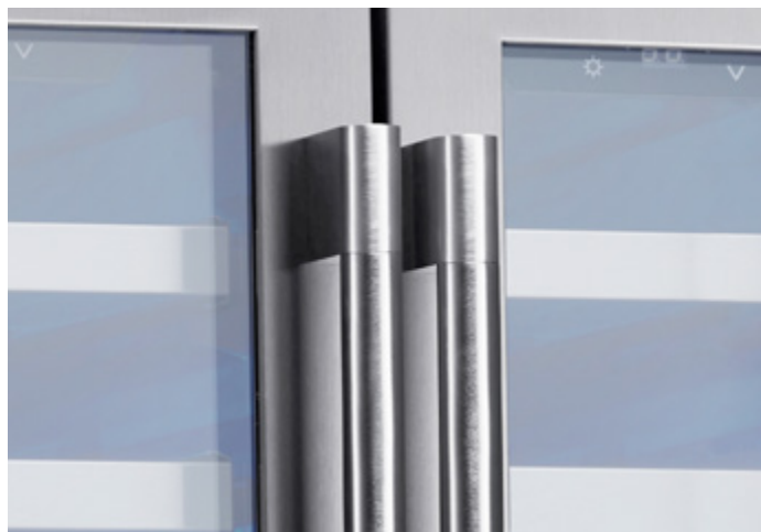
Optional Pro Handles