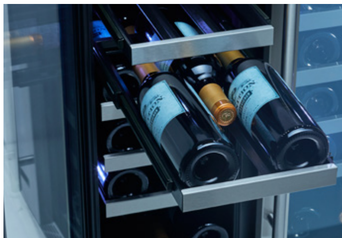
Full Extension Wood Racks