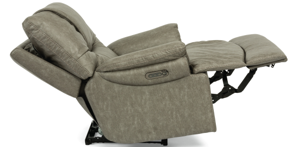
1719-50PH in fabric 770-02