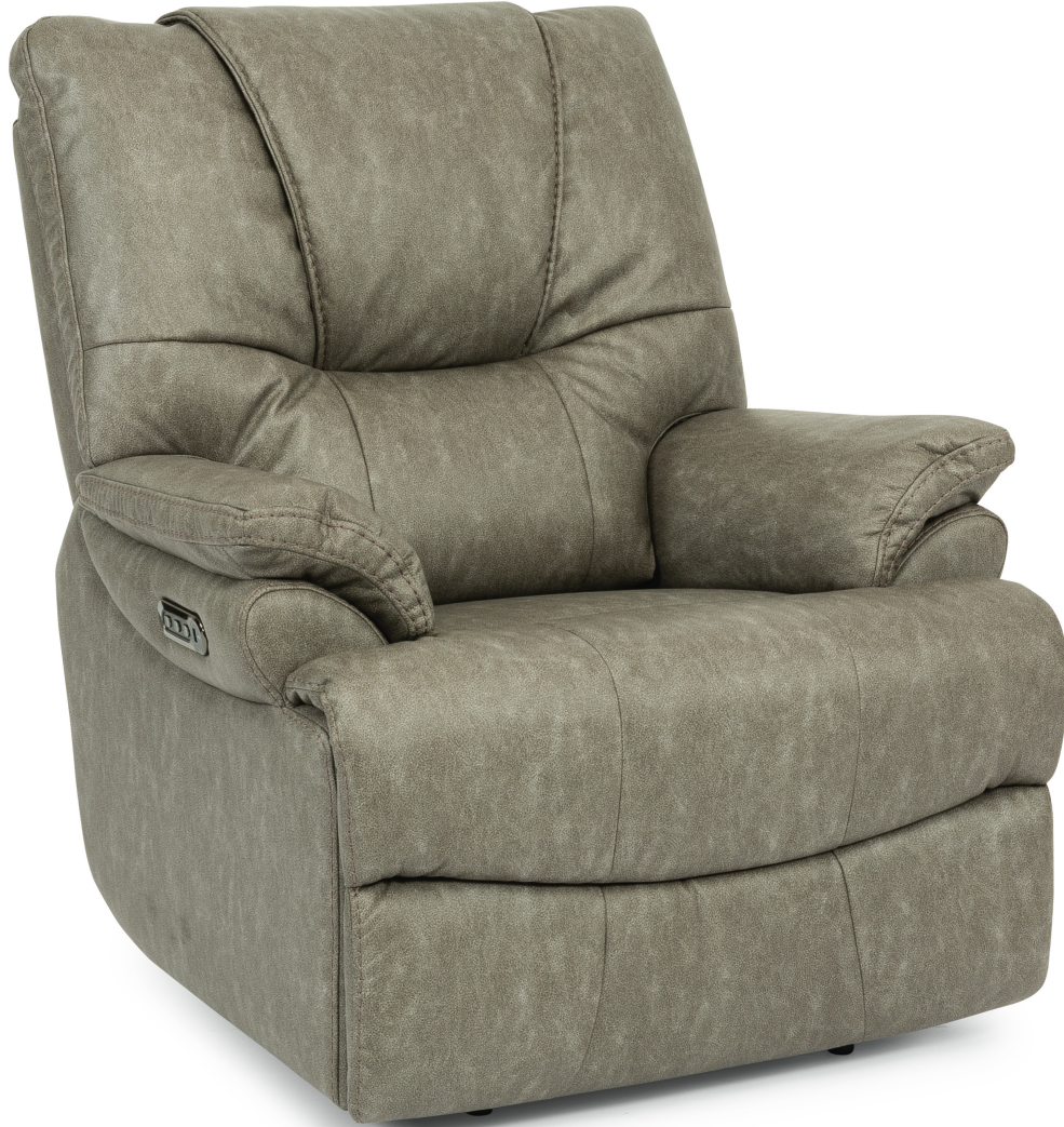
1719-50PH in fabric 770-02