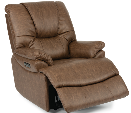
1719-50PH in fabric 770-71