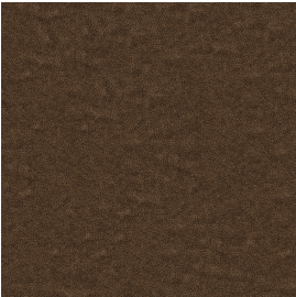
Medium Brown 770-71 Fabric

Printed samples may vary from actual swatches. Please refer to swatches for actual color.