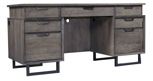
IHP-304-FSL 66" Executive Desk