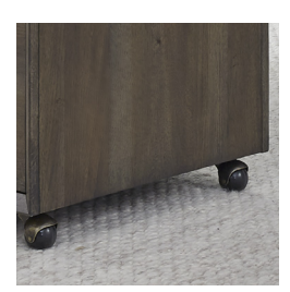
Low profile casters on rolling file (346)