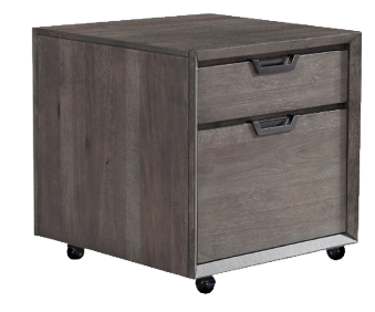
IHP-346-FSL Rolling File

• Locking lateral file holds letter or legal size files