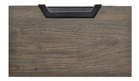
Fossil Finish and Top Mounted Hardware in Gunmetal Finish

Please note some color variations of our furniture finishes and fabrics are possible due to room lighting. Please use as a reference only.