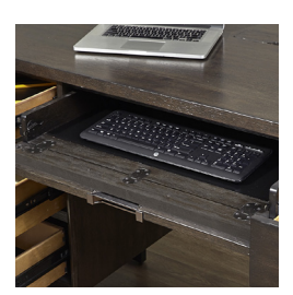
Drop front keyboard drawer (304, 316, 360WD)