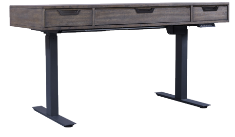
IHP-360T-FSL 60" Adjustable Lift Desk Top 60W \times 7H \times 28D (for IUAB-301-1)