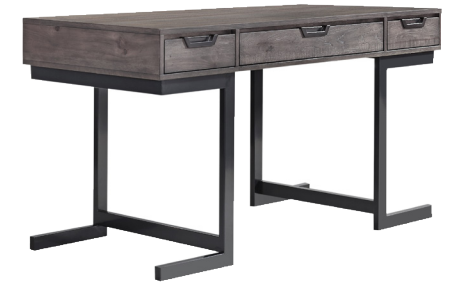
IHP-360WD-FSL 60" Writing Desk