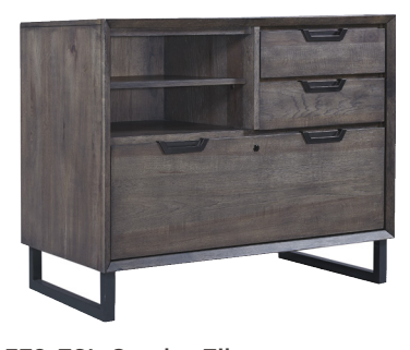
IHP-378-FSL Combo File