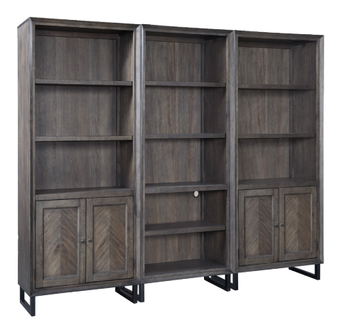
IHP-333-FSL Open Bookcase 32W x 76H x 14D