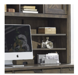
Shelves remove to fit multiple monitors (317)