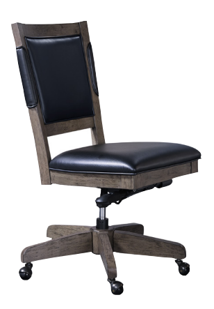
IHP-366-FSL Office Chair