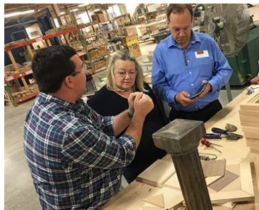
At Chaddock College designers and retailers try their hand at distressing!

Distressing is the by-hand artisan process that adds character, nuance and depth to the finish of new wood furniture. Chaddock's distressing process enhances the unique and intrinsic characteristics of individual wood species, teasing out wood's natural beauty and preparing it for our multi-step finishing process. Pick, chain loop, chisel and rock, Chaddock artisans use a variety of tools to achieve just the right look. Your look!