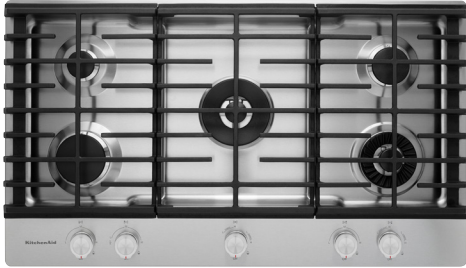
Stainless Steel KCGS956ESS