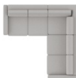
07/11/08 97 x 97" 247 x 247 cm

Seat Depth: 21" / 55 cm Seat Height: 19" / 47 cm Arm Depth: 36" / 90 cm Arm Height: 24" / 61 cm