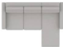
07/15 94 x 57" 239 x 145 cm