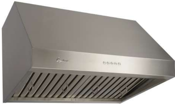
30" Stainless Steel