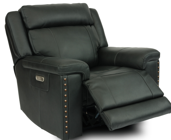
1040-50PH in leather 598-00