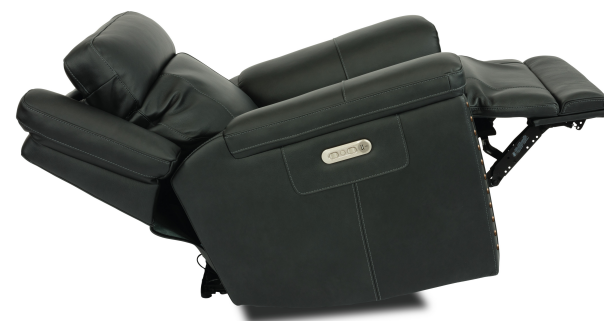
1040-50PH in leather 598-00