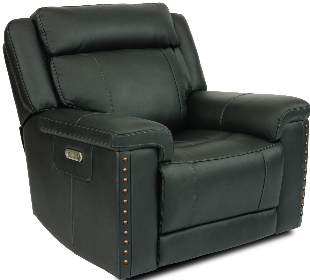
1040-50PH in leather 598-00