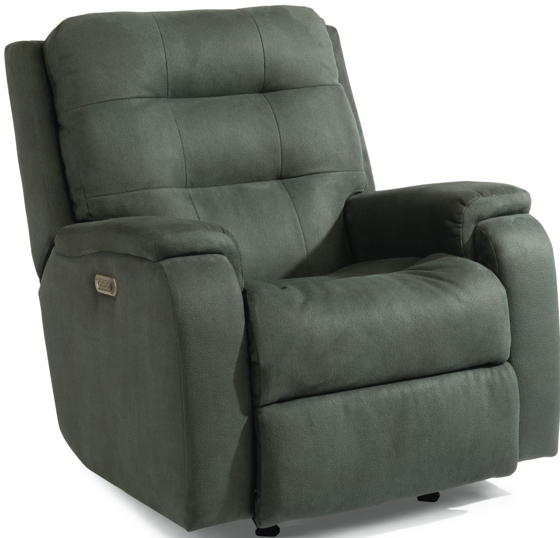
2810-51L in fabric 407-30