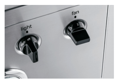
4-Speed Blower Control Ultra-quiet blower gives you precise control over airflow.