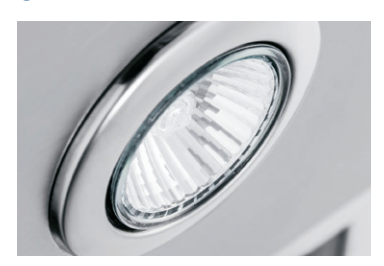
Halogen Lighting Two halogen lights provide bright illumination of the cooktop surface.