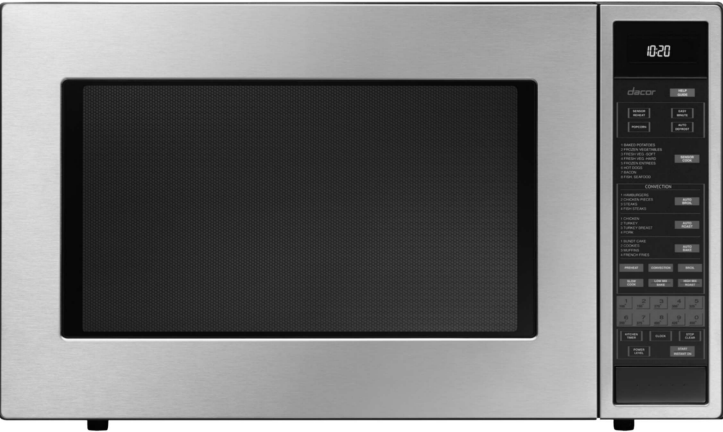
DCM24S – Silver Stainless