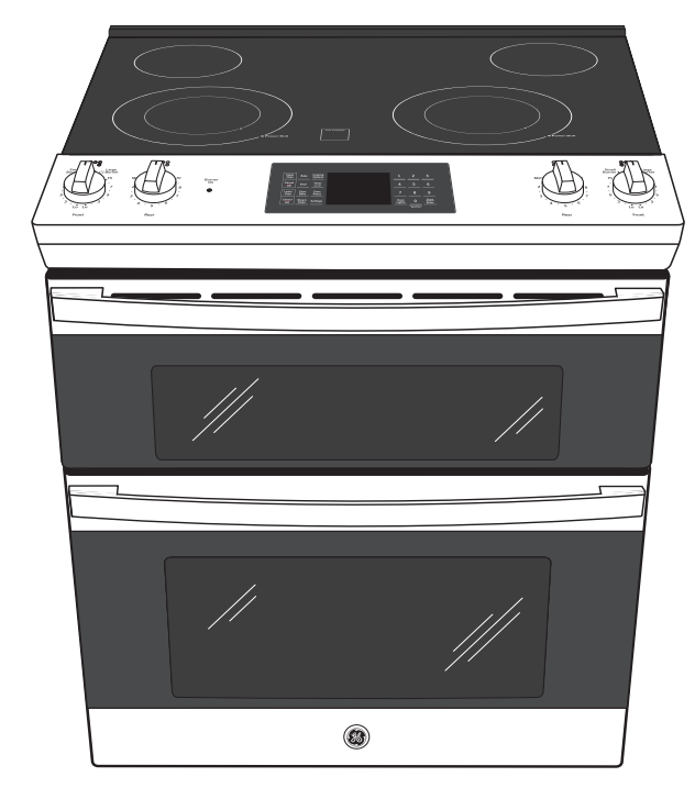
Visit geappliances.com for more info