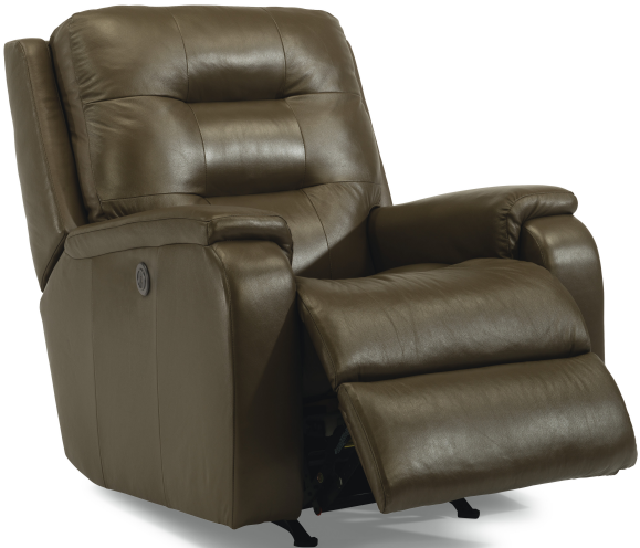
3810-51M in leather 824-74