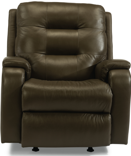
3810-51M in leather 824-74