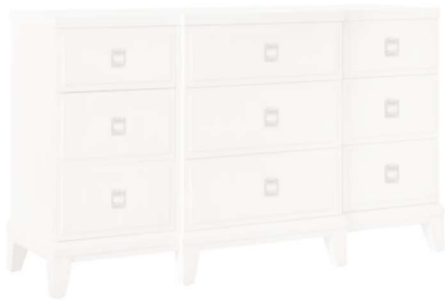
Madison 9-Drawer Dresser in a Grey-White Wash Finish S916-010