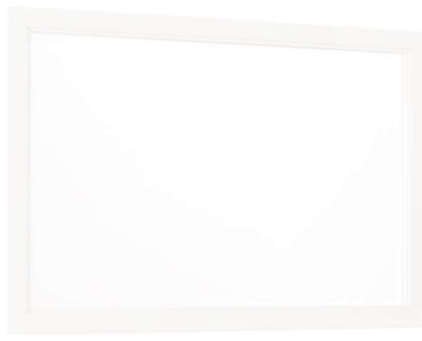
Madison Beveled Dresser Mirror in a Grey-White Wash Finish S916-030