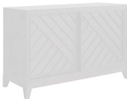
Lenox Sliding Door Server S964-146