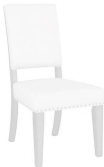
Lenox Upholstered Side Chair with Nail Head Trim S964-154