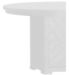
Lenox Round Dining Table S964-DR-K1

See an error on this page? Please report it so that we may correct it.