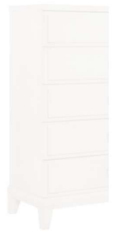
Madison 5-Drawer Chest in a Grey-White Wash Finish S916-040