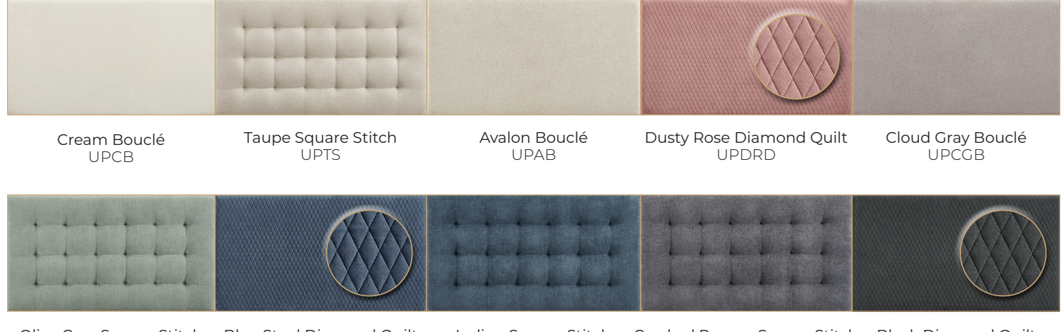
Olive Gray Square Stitch