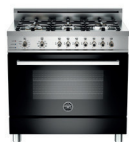
BLACK (NE) PRO36 6 DFS NE