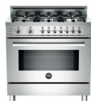
STAINLESS (X) PRO36 6 DFS X

Color is an essential expression of Italian exuberance and artistic elegance. Bertazzoni celebrates these special qualities with seven color choices inspired by the wonderful produce of Emilia-Romagna, heartland of Italian food since Roman times.