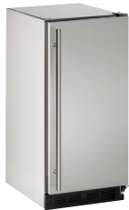
STAINLESS SOLID (LOCK)