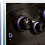
Built In Control Panel Lights