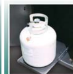
Pull Out Tank Drawer