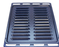
Broiler Pan / Grid

© 2021 Sharp Electronics Corporation. All rights reserved.