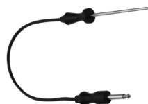
Meat Temperature Probe