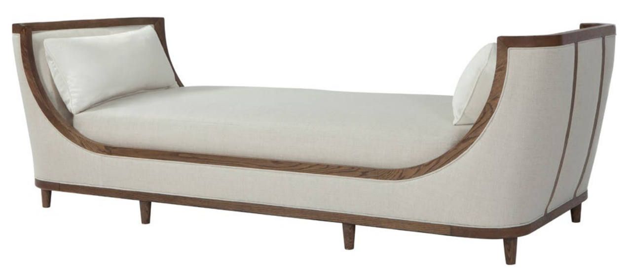
MB501-10 Ventana Daybed Upholstered Chair

Solid Oak Frame with Totem Finish Tight Seat and Backs with Two Throw Pillows