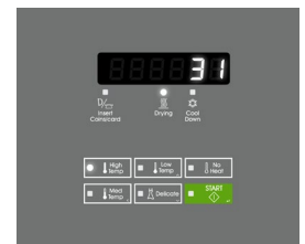
DV6 Control Panel