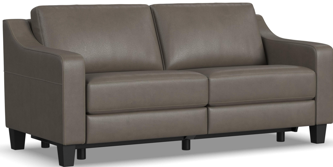
1118-620P in Leather 019-70