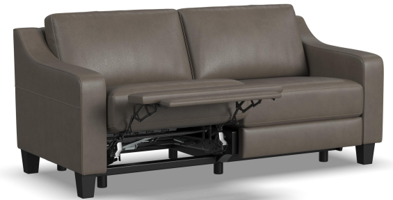
1118-620P in Leather 019-70