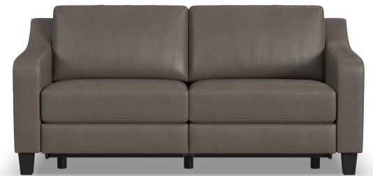
1118-620P in Leather 019-70