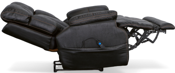
1594-50PH in Fabric 374-00