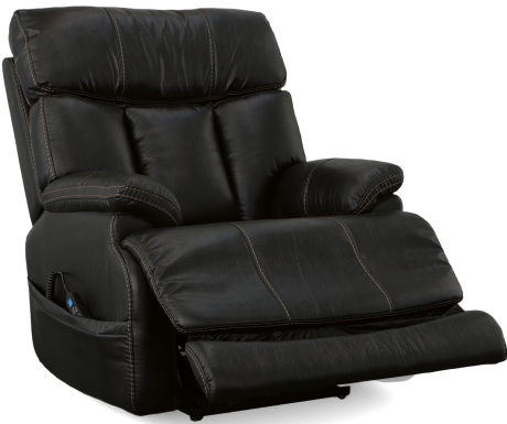
1594-50PH in Fabric 374-00