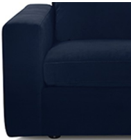
LOOSE BOX BORDER SEAT