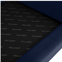
SINUOUS SPRINGS SUSPENSION