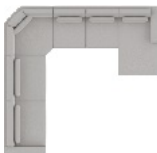
A2/9W/90/15 147 x 140" 374 x 356 cm