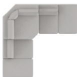
20/9W/19 115 x 66" 293 x 168 cm