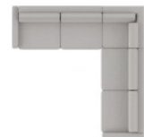
B2/9B/B3 109 x 109" 277 x 277 cm