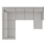
B4/90/15 117 x 125" 298 x 318 cm