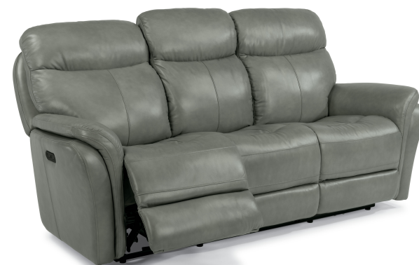
1653-62PH in leather 360-01