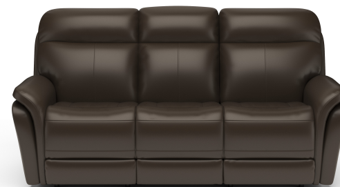
1653-62PH in Leather 360-70