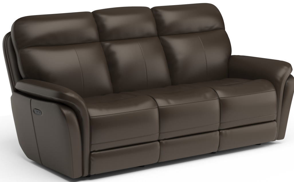
1653-62PH in Leather 360-70