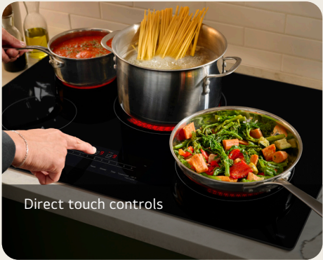
Direct touch controls