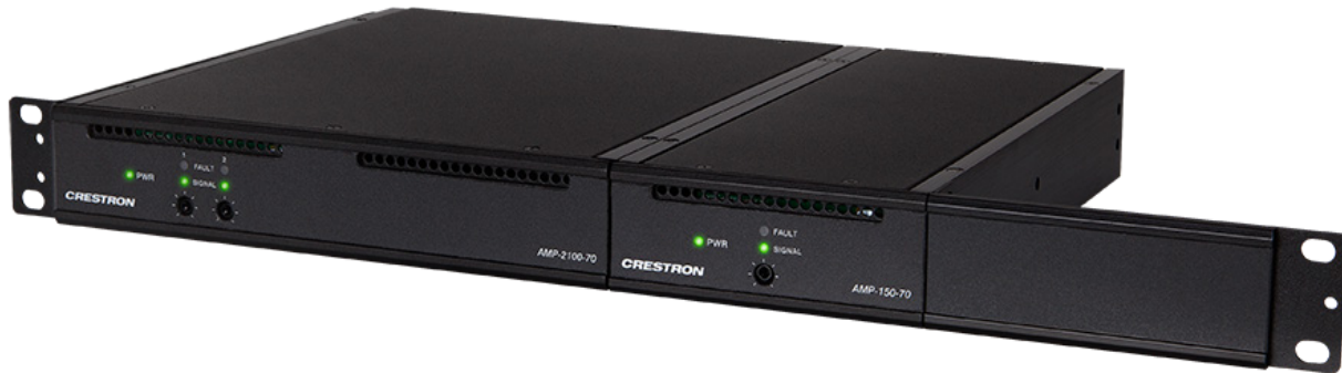
One 1/2-width and one 1/4-width units ganged together (ganging kit and rack mounting kit included)