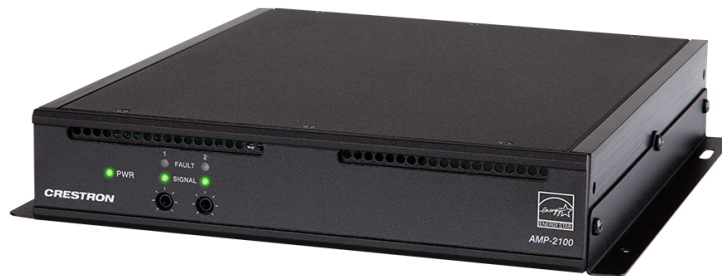
Single 1/2-width unit with surface mounting kit (included)