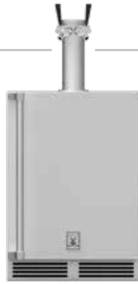
24" Beer Dispenser