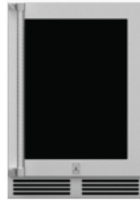
24" Dual Zone Refrigerator with Wine