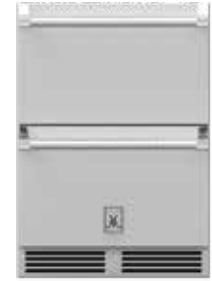
24" Refrigerated Drawers / 24" Refrigerated Drawer and Freezer Drawer