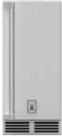
15" Ice Machine