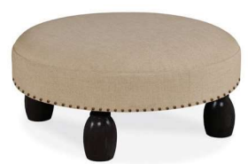
SEAT HEIGHT 17.5"