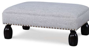
STD HEIGHT 17.5"