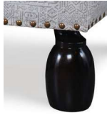
#31 - ROUND