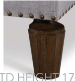
STD HEIGHT 17.5"