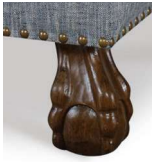
#30 - CLAW

3 SELECT YOUR DESIRED LEG (3 Options at No Charge):