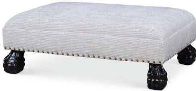
STD HEIGHT 17.5"