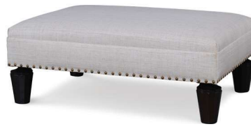
STD HEIGHT 17.5"