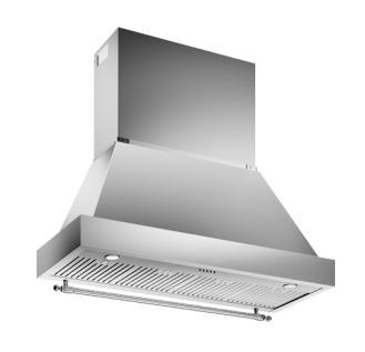
K48HERTX + KC48HERTX Stainless steel canopy