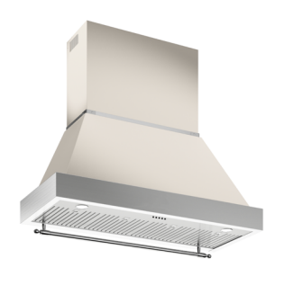
K48HERTX + KC48HERTAV Ivory gloss canopy