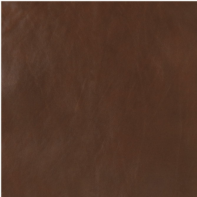
LE0331 | SEPIA LEATHER GRADE L3