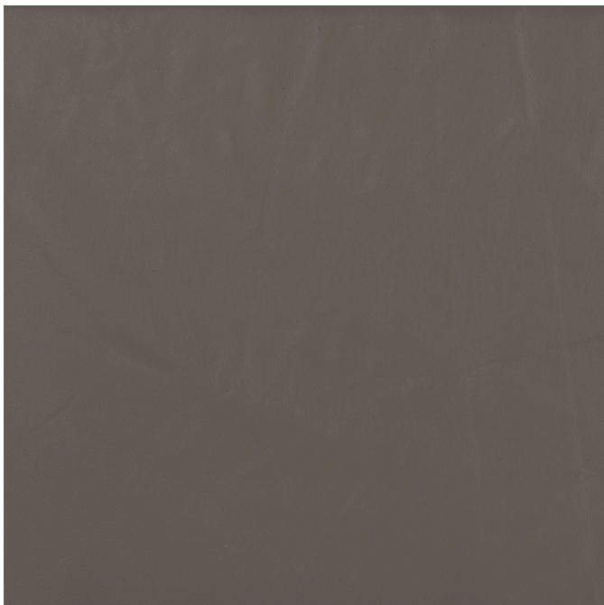
LE0402A | PETRIFACTION LEATHER GRADE 3