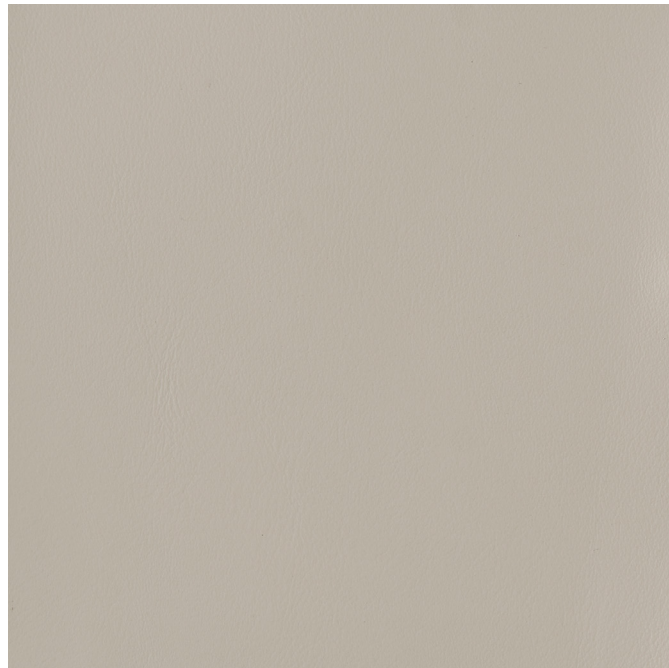
LE0396.F | SANDBANK LEATHER GRADE 3