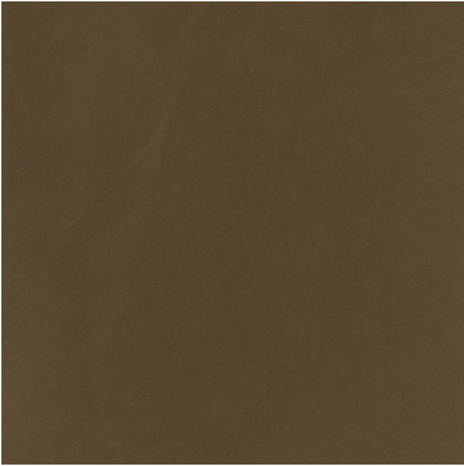
LE0422 | TRANQUIL LEATHER GRADE 3