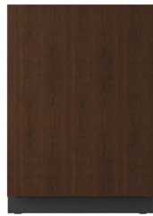
URBD424-IS01A Integrated Solid