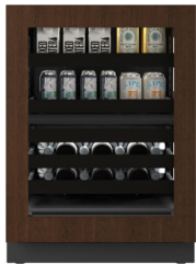
URBD424-IG01A Integrated Frame Glass