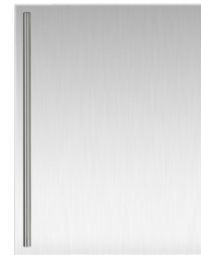
ULASBPGLOSS24 (Frame) ULASBPSOLID24 (Solid) Stainless Steel Door Wrap with Classic Bar Pull