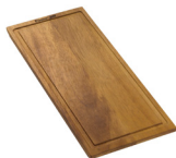
M6 chopping board