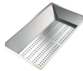
Z2 Stainless steel perforated pan