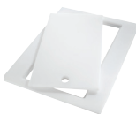
N3 HDPE twin chopping board