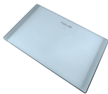
L4 Glass chopping board