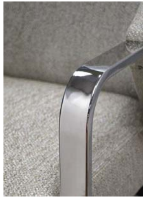
Metal - Polished Stainless