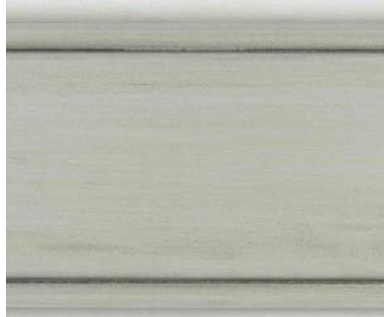
Urban Gray Premium