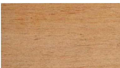
Honey Maple Premium