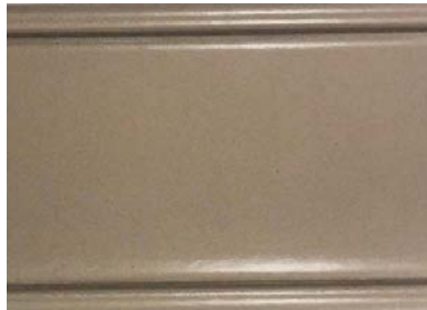
Warm Silver Metallic Premium