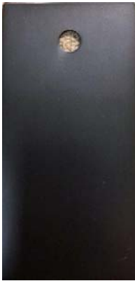
Metal - Oil Rubbed Bronze