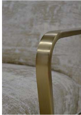
Metal - Antique Bronze Finish