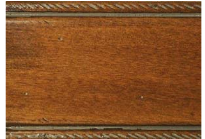
Vintage Latte Premium