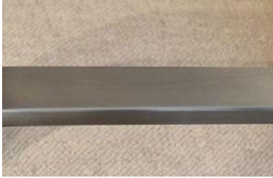
Veranda Brushed Stainless Steel