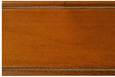
Toasted Almond Standard