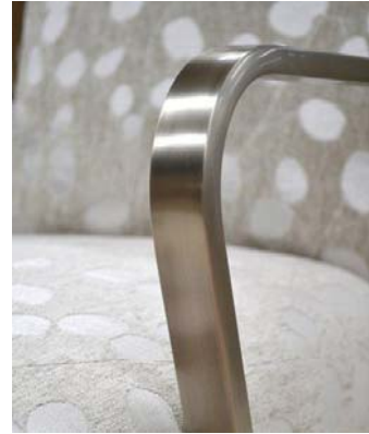
Metal - Antique Silver Finish