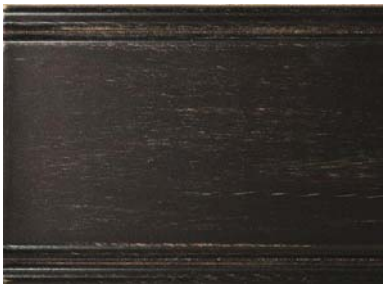
Antique Black Premium

Wood is a nature's product having natural variations in grain and coloration that come from the growth pattern of each tree. Due to these natural variations, finishes can and will vary. Exact color matches are not guaranteed. The finish samples on this website and in our product literature have been reproduced as accurately as photographic and printing technology will allow. Individual monitors and printers will alter the appearance of color and grain, Designmaster is not responsible for any scanning or typographical errors. For the most accurate representation of our wood finishes, please visit a local Designmaster Furniture dealer.