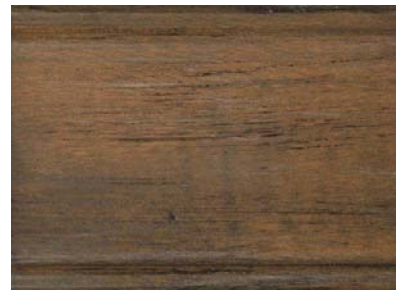
Weathered Wood - Symphony