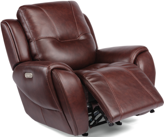
1134-54PH in leather 297-70