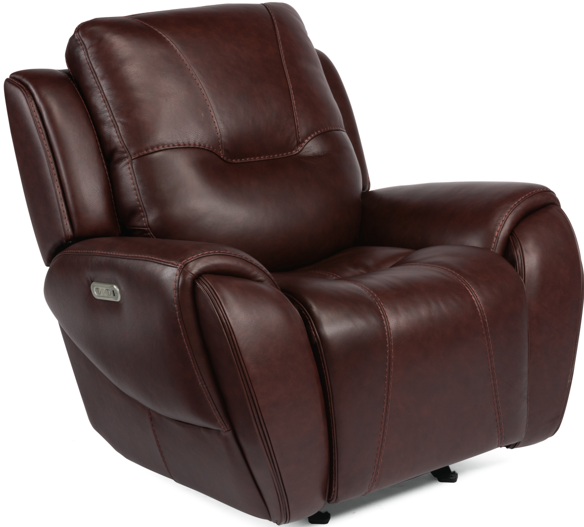
1134-54PH in leather 297-70