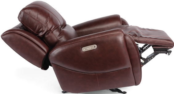
1134-54PH in leather 297-70