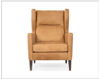
Leather shown: ML1002-85 Skylen Butternut Finish: Perk