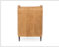
Leather shown: ML1002-85 Skylen Butternut Finish: Perk