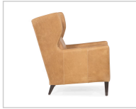
Leather shown: ML1002-85 Skylen Butternut Finish: Perk