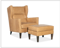
Leather shown: ML1002-85 Skylen Butternut Finish: Perk