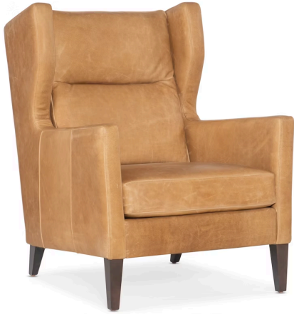
Leather shown: ML1002-85 Skylen Butternut Finish: Perk