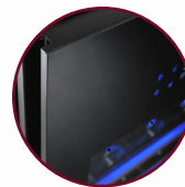
FULL GLASS DOOR

* Capacities are approximate and calculated with bordeaux bottles type.